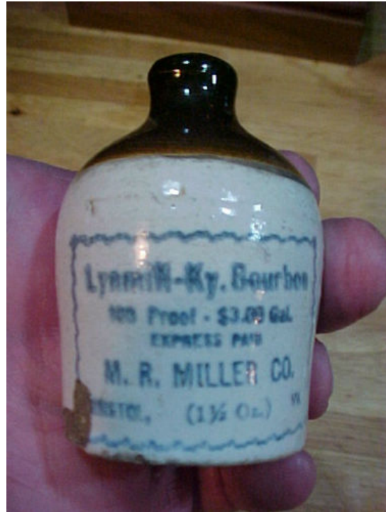
Fig. 12: M.R. Miller Co., Bristol

No, liquor mini jugs are not given away any more. In fact, finding one to purchase for $100 or under may be difficult. Why? They are old, most of them antiques; avidly collected locally as well more generally; small and not space taking, and easily displayed. All these attributes add up to the reality that what once liberally was handed out for free now require big bucks to acquire.