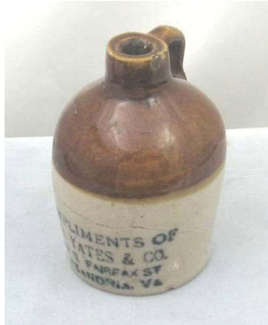
Fig. 5: Yates & Co, DC