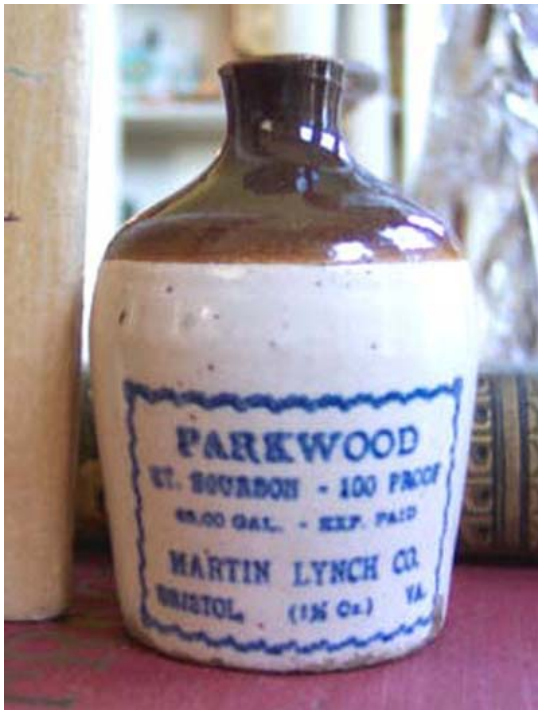
Fig. 11: Parkwood, Lynch, Bristol

Notes: The material for this article were drawn from a number of sources on the Internet, including auction sites, principally eBay, for prices.