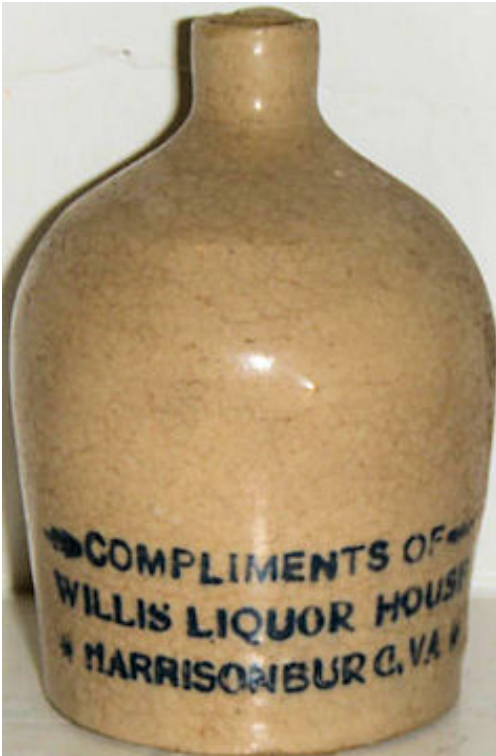
Fig. 7: Willis Liquor House, Harrisonburg

More information is available about the Martin Distilling Co. of Roanoke who produced a mini jug (Fig. 8). Although it appeared in local directories on Tinker Creek Rd. for only 1909 and 1910, Martin Distilling obviously had a longer business life. In 1912 it ran an extensive ad in the Roanoke Herald Journal. In 1914 the Federal Government recorded a transaction from its bonded warehouse. In 1918, after Virginia had voted prohibition, the Martin organization re-incorporated as a distillery. What the company was making was not recorded and remains a mystery since whiskey was banned.