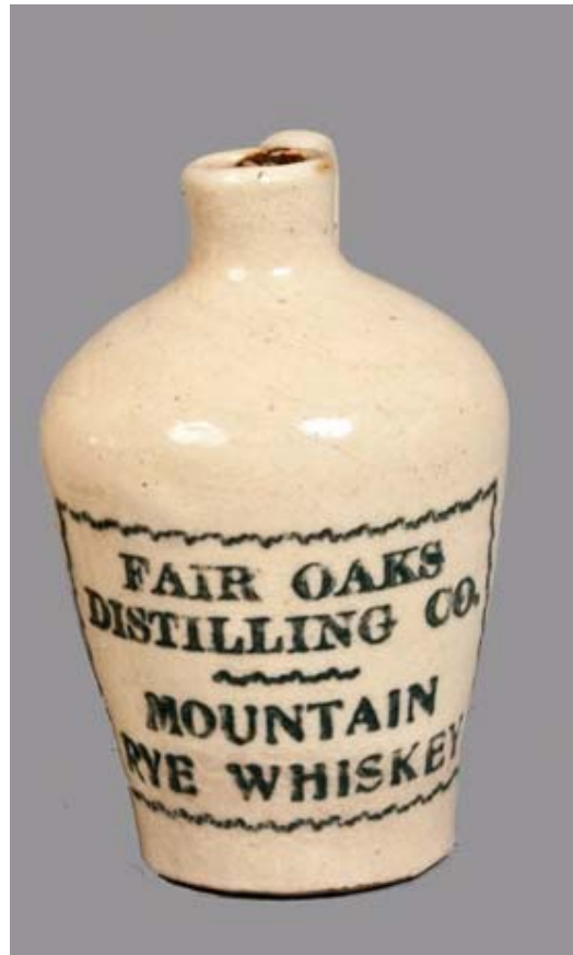
Fig. 6: Fair Oaks, Richmond?

The Fair Oaks Distilling jug, advertising Mountain Rye Whiskey (Fig. 6), was reputed to be a Richmond, Virginia, product but I have been unable to confirm that. Nor have I found references to the Willis Liquor House in Harrisonburg. The Willis mini jug shown here sold at auction for $265 in May 2010 (Fig. 7).