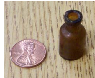
This tiny bottle seen at our April meeting may have contained opium.

Mini Jugs: They Don't Give Them Away Anymore by Jack Sullivan.....page 2 Upcoming Area Bottle Shows.....page 6