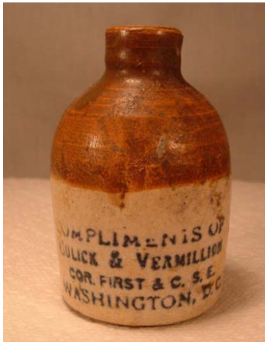
Fig. 4: Gulick & Vermillion, DC

Across the Potomac River in Alexandria, the Yates family was involved in the whiskey trade for several generations. In 1818, William Yates purchased an oyster house and tavern that reputedly had been frequented by George Washington. He also purchased other neighborhood lots and expanded the facility. His saloon was renamed Yates Tavern, and the area is still called Yates Gardens. Later family members opened a retail liquor store in Old Town at 300 S. Fairfax. Their mini jug, shown here, sold for $105 at auction in Sept. 2010 (Fig. 5).