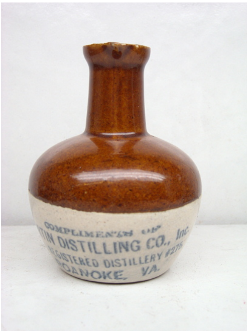
Fig. 8: Martin Distilling, Roanoke

More information is available about the Martin Distilling Co. of Roanoke who produced a mini jug (Fig. 8). Although it appeared in local directories on Tinker Creek Rd. for only 1909 and 1910, Martin Distilling obviously had a longer business life. In 1912 it ran an extensive ad in the Roanoke Herald Journal. In 1914 the Federal Government recorded a transaction from its bonded warehouse. In 1918, after Virginia had voted prohibition, the Martin organization re-incorporated as a distillery. What the company was making was not recorded and remains a mystery since whiskey was banned.