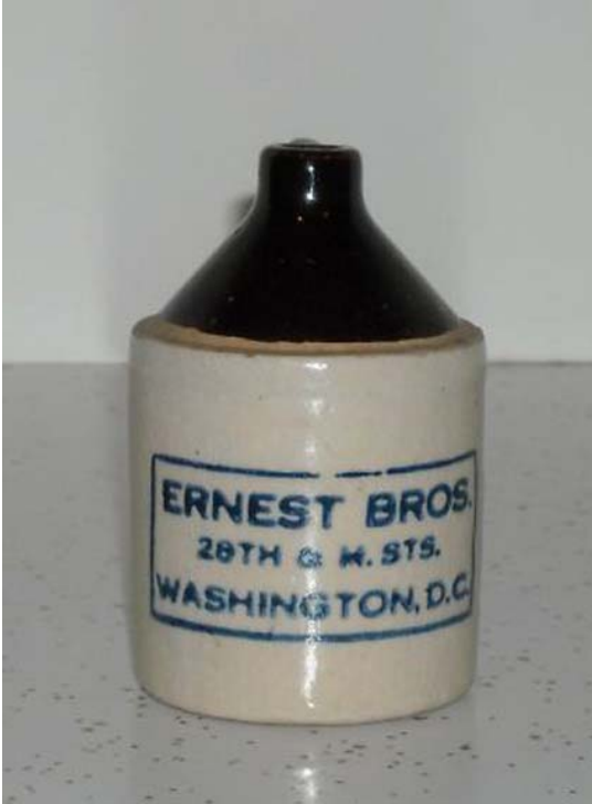
Fig. 3: Earnest Bros., DC