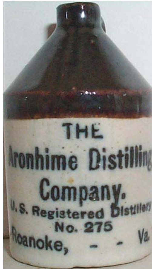
Fig. 9: Aronhime Distilling, Roanoke