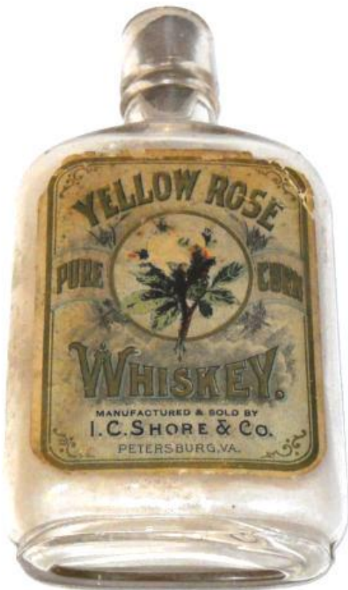
Fig. 1: "Yellow Rose" Whiskey flask