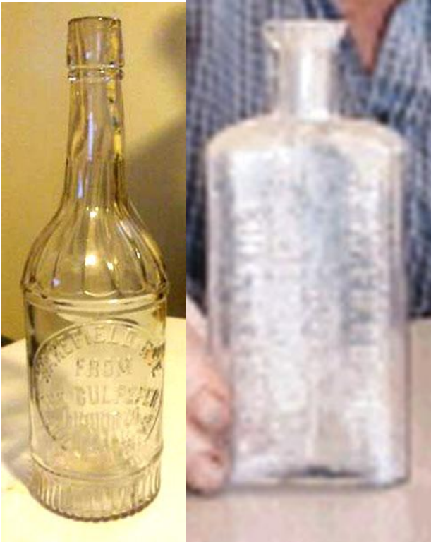
Fig. 10: Wakefield Rye bottle Fig. 11: Wakefield Rye mini-flask

who found it is a native of Culpeper who has been trying to learn more about the company origins for the past 22 years, with no success. My efforts, considerably less time consuming, have been similarly fruitless. This one remains a mystery.