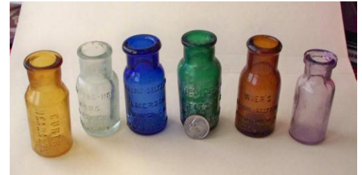
Small Bottles displayed by Mike Cianciosi

Virginia Whiskeys: Labeled and Embossed by Jack Sullivan.....page 2 Upcoming Area Bottle Shows.....page 4