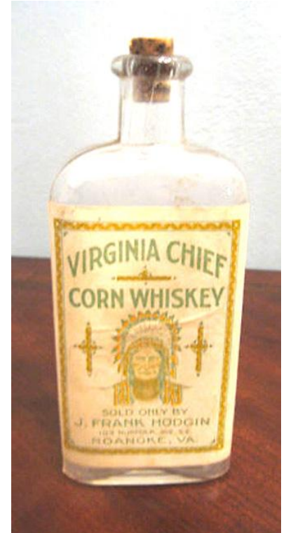
Fig. 2: "Virginia Chief" Corn Whiskey flask