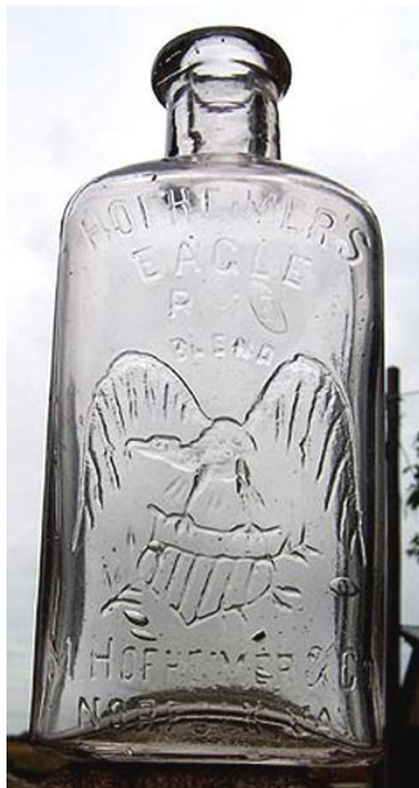
Fig. 6: Hofheimer Rye bottle

M. Hofheimer & Co. called their whiskey “Eagle Rye” and embossed a bird looking more like a vulture than an eagle on the bottle (Fig. 6). This company was in business in Norfolk, according to directories, from 1903 to 1915. Their locations were 78-80 Plume St. (1903-1904), Atlantic opposite the Post Office (1906-1908), 31 Atlantic (1909-1912), and 122 Atlantic (1913-1915). The Hofheimer family were early Jewish settlers in Virginia, including having stores in Colonial Williamsburg. The Norfolk liquor business terminated when Virginia went dry.