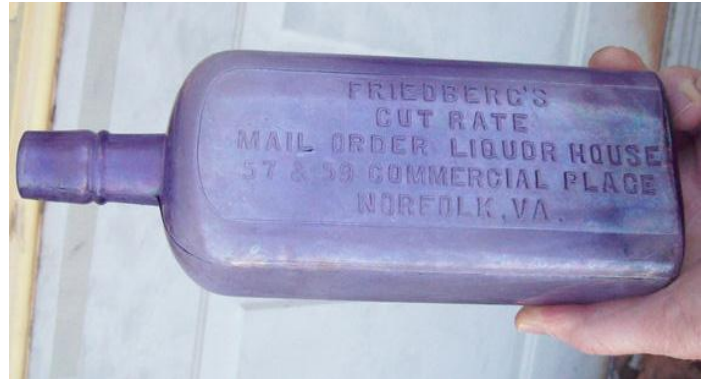
Fig. 7: Friedenberg liquor bottle