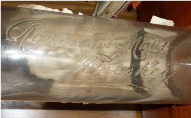
Fig. 4: Rooney Malt embossing