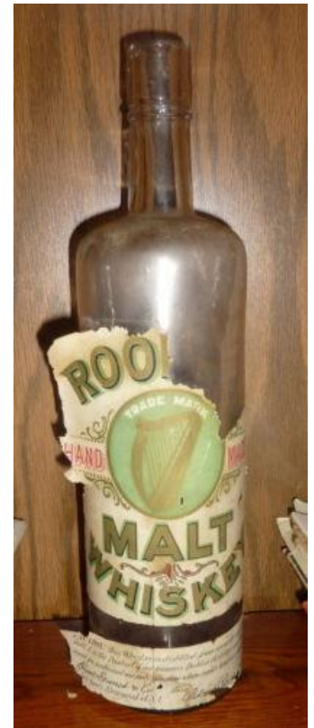
Fig. 3: Rooney Malt bottle