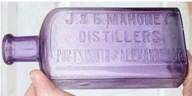
Fig. 5: Mahoney flask