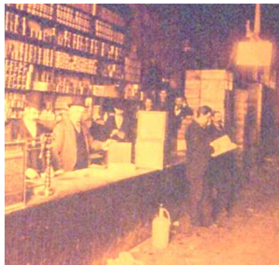
Fig. 3: Hume's store/Hume with ledger photo

A year after his marriage Hume opened his own grocery store in downtown DC, located on Pennsylvania Avenue near the old Central Market. He is shown here in 1892 perusing a ledger ( Fig. 3 ). The store prospered, with the sale of liquor being an important part of his merchandise. Among Hume's brands were “Old Stag,” Homestead Old Rye,” “Old ‘A’ Whiskey” and “Warwick Old Rye.” as shown here in four flasks ( Figs. 4-7 ). One observer has noted that Hume chose to emboss his bottles rather than slap paper labels on them. Going to this additional expense, it is suggested, indicates he knew he could count on each brand having substantial sales.