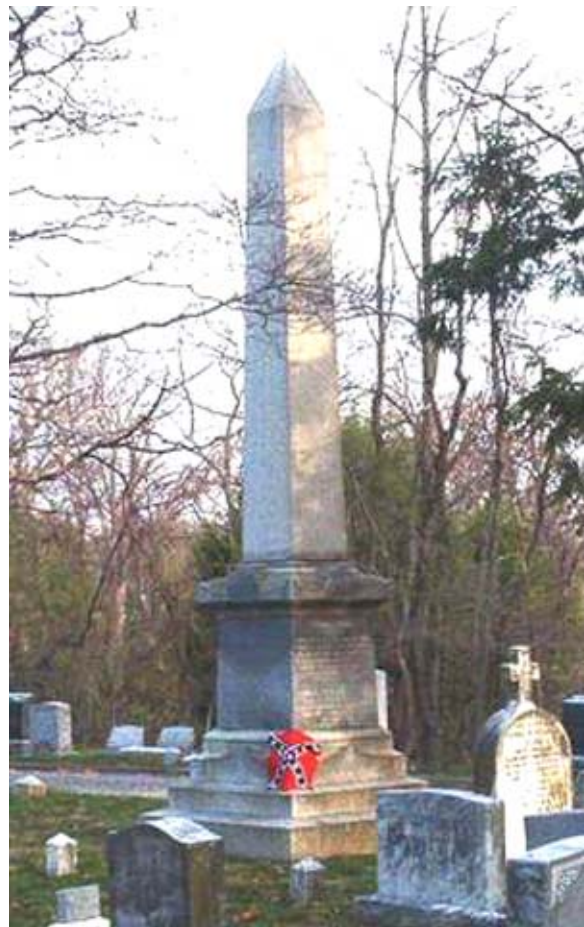
Fig. 12: Hume grave marker