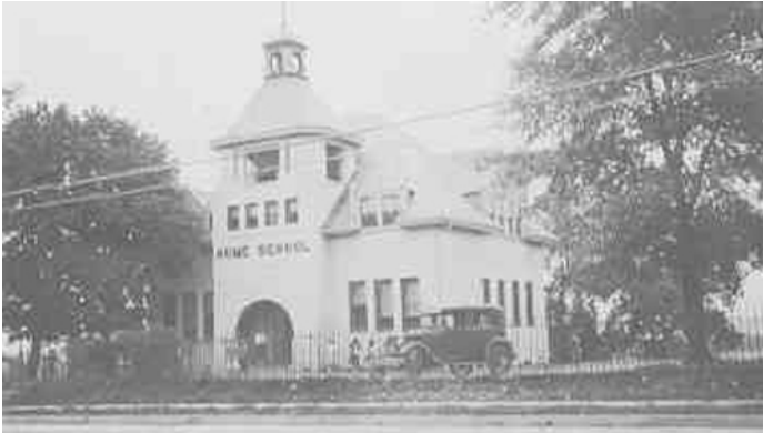
Fig. 9: Hume school

( Fig. 9 ) was named for him. Hume Elementary School operated for 67 years, closing in 1958 but rescued by citizens for use as a local museum. It stands on Arlington Ridge Road and is listed on the National Register of Historic Places.