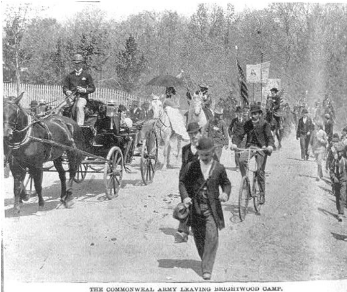
Fig. 10: Coxe's Army

In a more controversial act of generosity, Hume provided food for Coxe's Army. That was a protest march by unemployed American workers, led by the populist Jacob Coxe ( Fig. 10 ). They marched on Washington D.C. in 1894, the second year of a four-year economic depression that to that time was the worst in U.S. history. It is considered the first significant popular protest march on Washington. (Needless to say it would not be the last.) Officially called the Commonwealth of Christ, the march was popularly named for its leader. According to press reports, Hume received a bouquet of flowers from the marchers as they left.