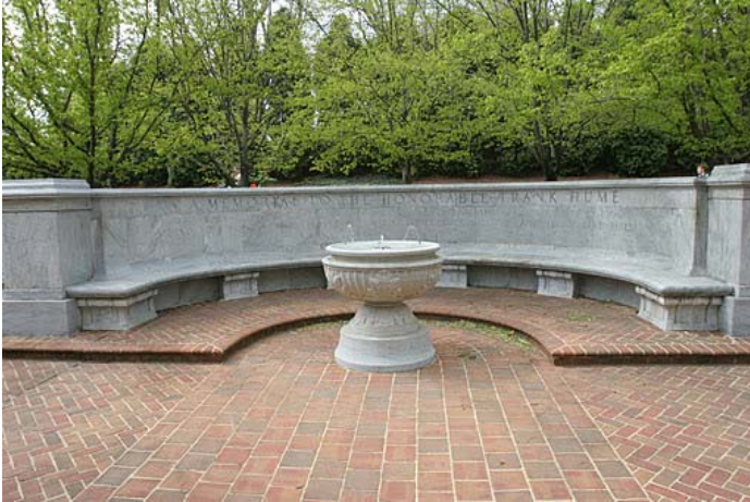
Fig. 13: UVA Hume Memorial