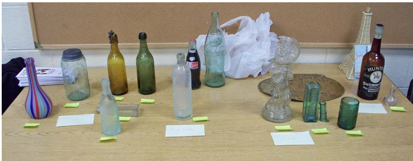
Club members brought some of their favorite acquisitions from 2011 to display at our January meeting.

Meetings: 8:00 PM on the last Tuesday of each month January-June, October-November; picnic in September.