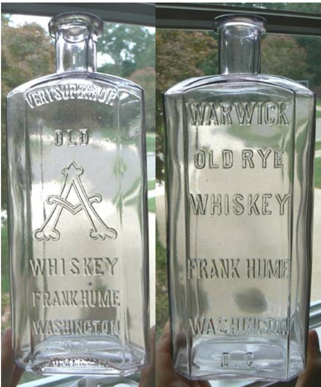
Fig. 6: "Old A " bottle Fig. 7: "Warwick" bottle