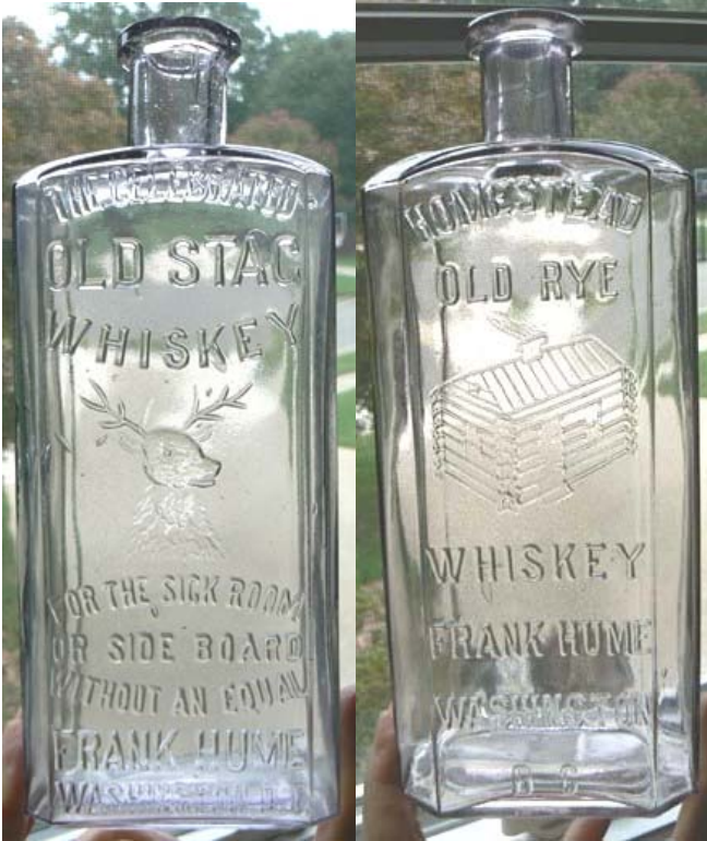
Fig 4: "Old Stag" bottle (left) Fig. 5: "Homestead" bottle (right)