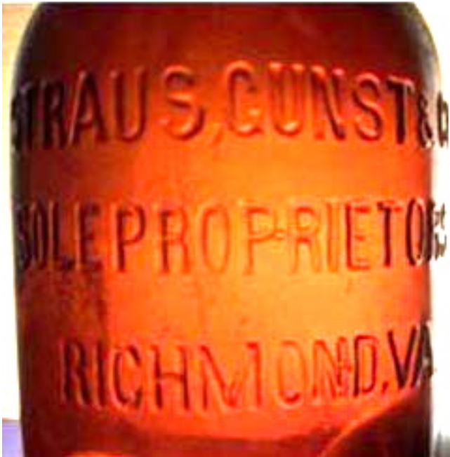
Fig. 6: Detail - amber quart

The liquor firm advertised widely in regional newspapers and claimed outlets for its whiskey in Washington, D.C., most of the larger cities in Virginia, North Carolina, and Jacksonville and Pensacola, Florida. It also carried on a vigorous mail order business, particularly in states and localities that had gone “Dry.” The liquor firm excelled in its giveaways, including 3 by 5 inches booklets of riddles and banquet toasts (Fig. 7,8).