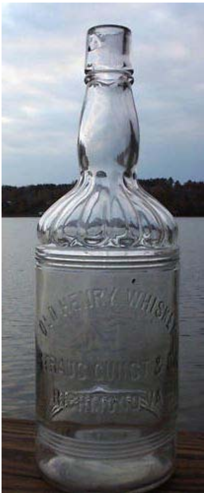
Fig. 11: Old Henry quart