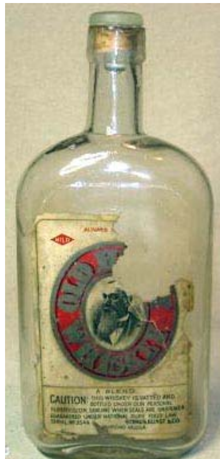
Fig. 9: Old Henry pint

Although Straus-Gunst marketed a number of brand names, two were principally featured. A moderately priced whiskey was “Old Henry Pure Rye. It came as a long-necked pint (Fig. 9), a flask size with a cork pull (Fig. 10), and in a a quart bottle (Fig. 11). In addition to the pocket mirror shown above, the firm gave away “Old Henry” shot glasses (Fig. 12) and a second style of pocket mirror (Fig. 13). All featured the man with the long beard – “Old Henry” Gunst.