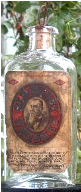
Fig. 10: Old Henry half pint