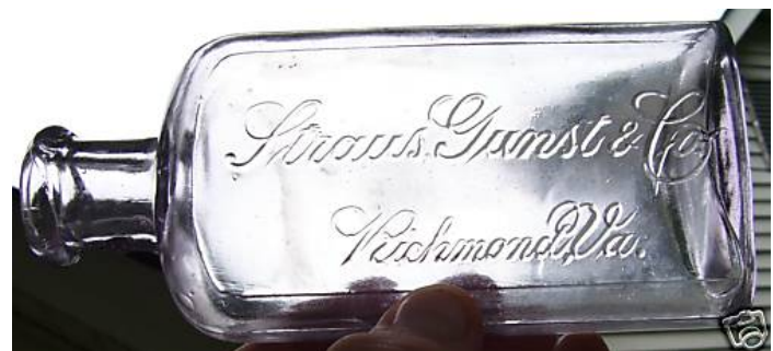
Fig 3: Straus-Gunst clear flask - script embossing