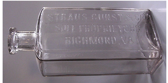
Fig. 2: Straus-Gunst clear flask

Straus-Gunst & Co. issued liquor in embossed clear flasks bearing its name in both block letters and script (Figs. 2, 3). The firm also put its products in larger jug-like containers (Fig. 4) and in dark amber “lady’s leg” quarts. The latter is shown here along with details of the embossing (Fig. 5, 6).