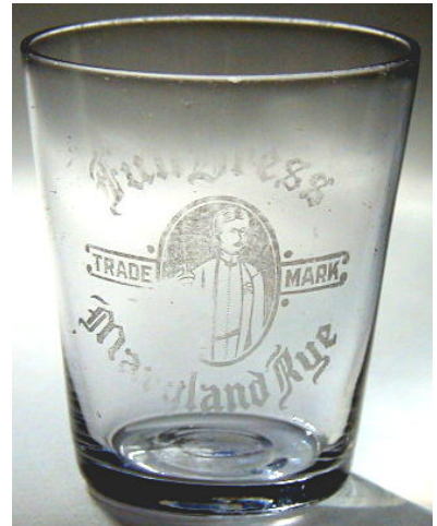
Fig. 15: Full Dress Rye shot glass