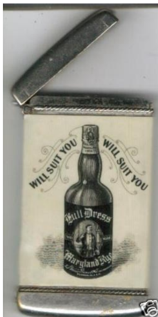
Fig. 14: Full Dress Rye match safe