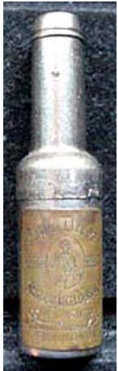
Fig. 16: Full Dress Rye corkscrew with case

The top quality whiskey featured by Straus-Gunst was "Full Dress Maryland Rye." A quart bottle of this brand is shown on a celluloid match safe (Fig. 14). Other advertising giveaways bearing this brand name were a shot glass (Fig. 15), a tube enclosed corkscrew (Fig. 16), and, for a saloon keeper, a metal sign showing a gent having a drink with a lady of dubious character (Fig. 17).