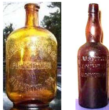
Fig. 4: Straus-Gunst amber jug (above left)