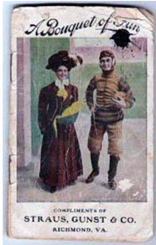
Fig. 8: Riddles booklet

The liquor firm advertised widely in regional newspapers and claimed outlets for its whiskey in Washington, D.C., most of the larger cities in Virginia, North Carolina, and Jacksonville and Pensacola, Florida. It also carried on a vigorous mail order business, particularly in states and localities that had gone “Dry.” The liquor firm excelled in its giveaways, including 3 by 5 inches booklets of riddles and banquet toasts (Fig. 7,8).