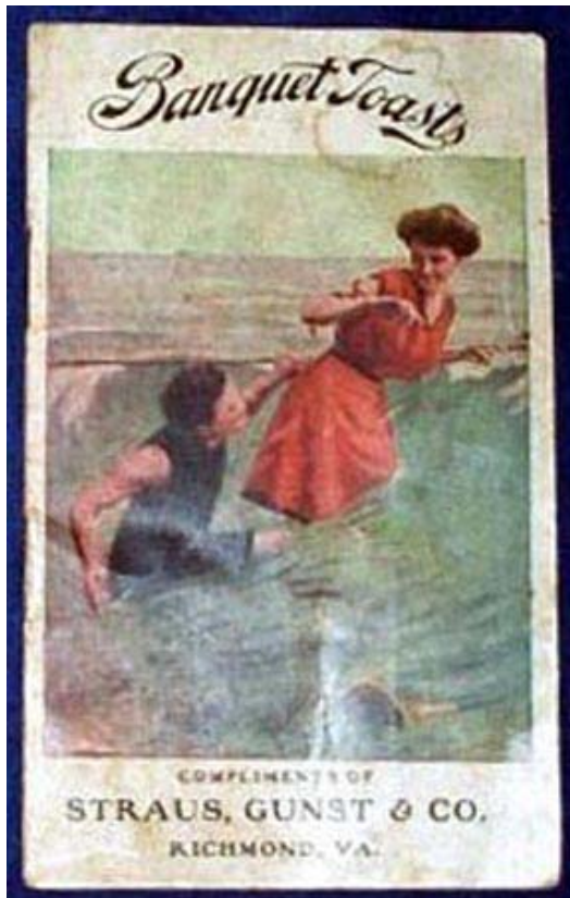
Fig. 7: Banquet toasts booklet