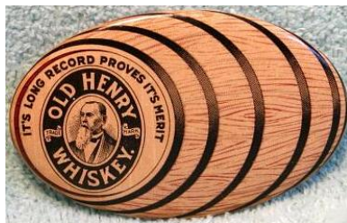
Fig. 13: Old Henry pocket mirror #2