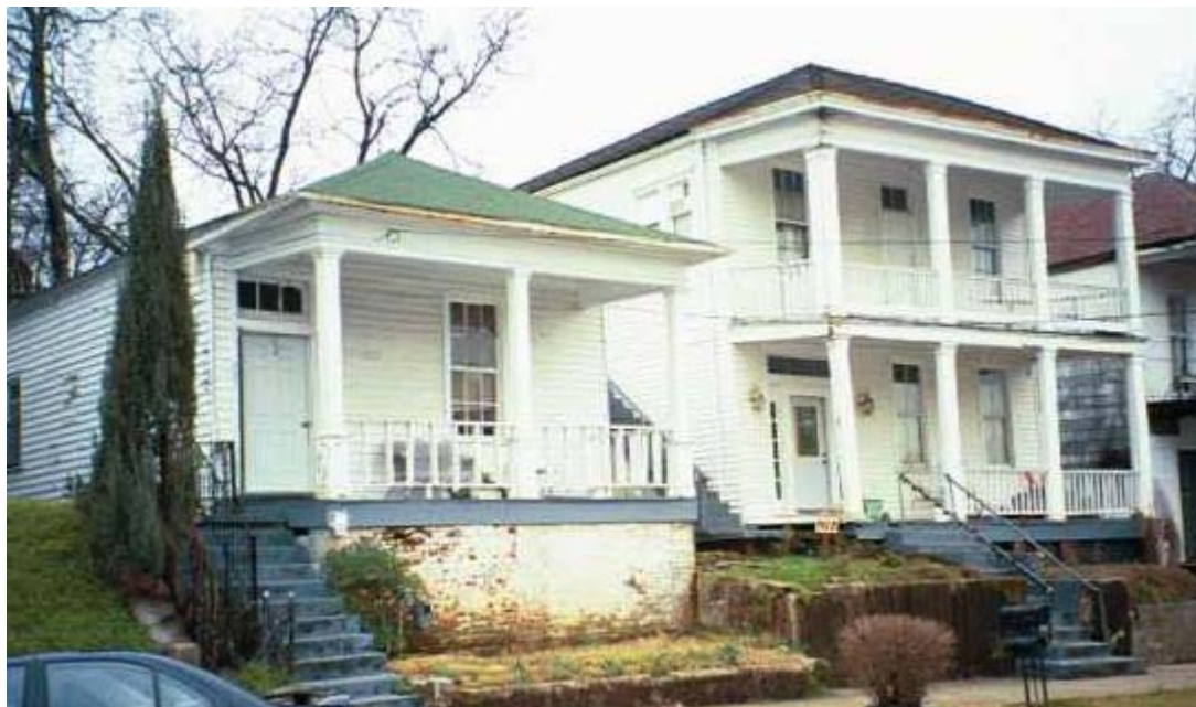
Over a Dozen Privies were Dug Behind these Beautiful Vicksburg, Mississippi Homes