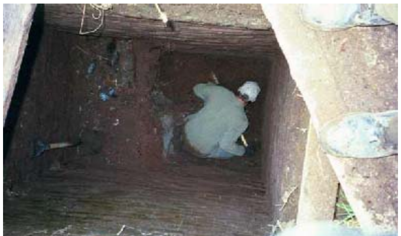
Strange Days Indeed: 12 Feet into a Square Brickliner in Mississippi and Finding Nothing but New York and New Jersey Bottles