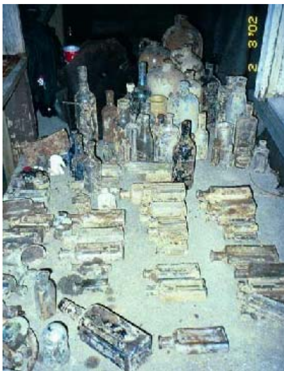
Loads of Vicsburg, Natches & New Orleans Druggists, Jugs, Biedenharns, and Tonics